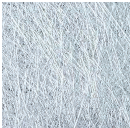
SEM (Scanning Electron Microscope) view of an Ultraflon M11 membrane.