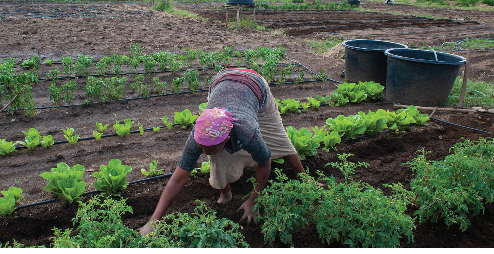
The use of elevated water storage tanks allows the efficient use of drip irrigation to combat drought in AF-funded project in Ethiopia.