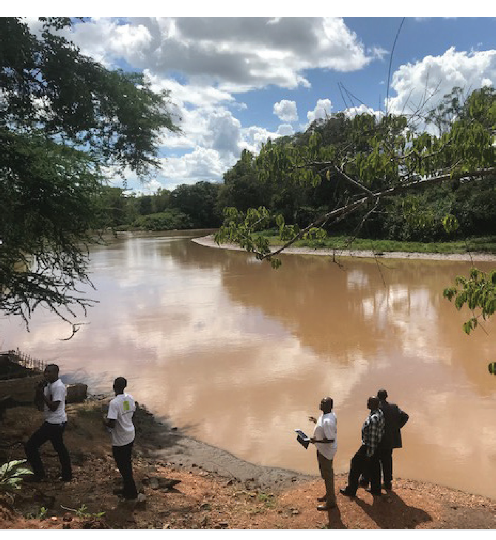
A village in Ghana uses river level markings to indicate when local communities should seek shelter.