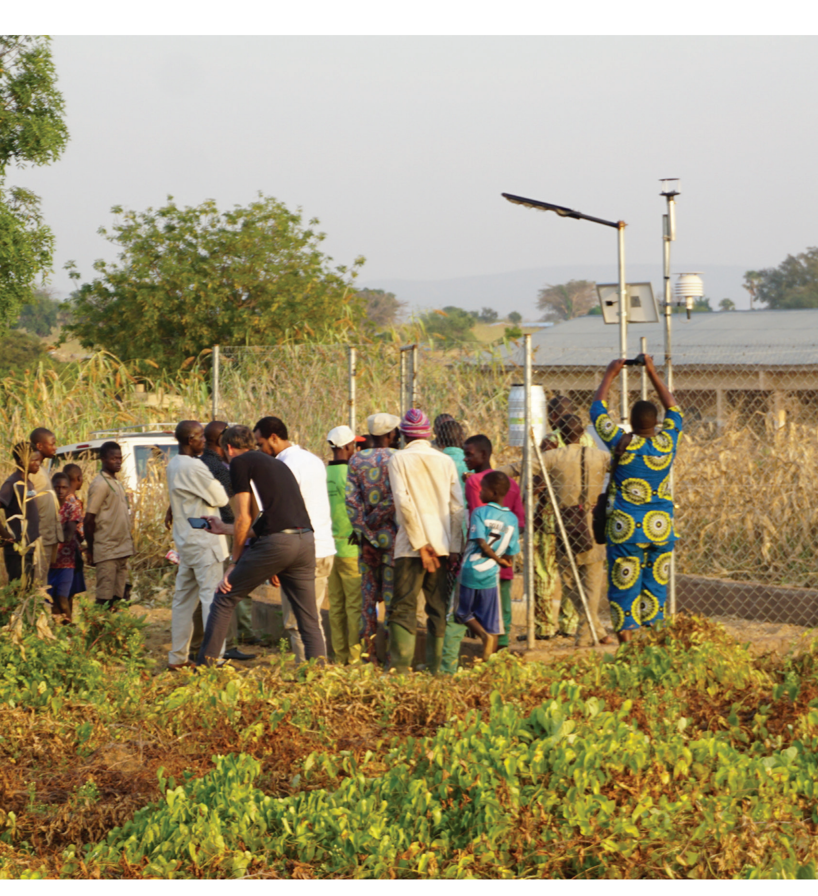
Community members learn how weather stations gather data in Benin