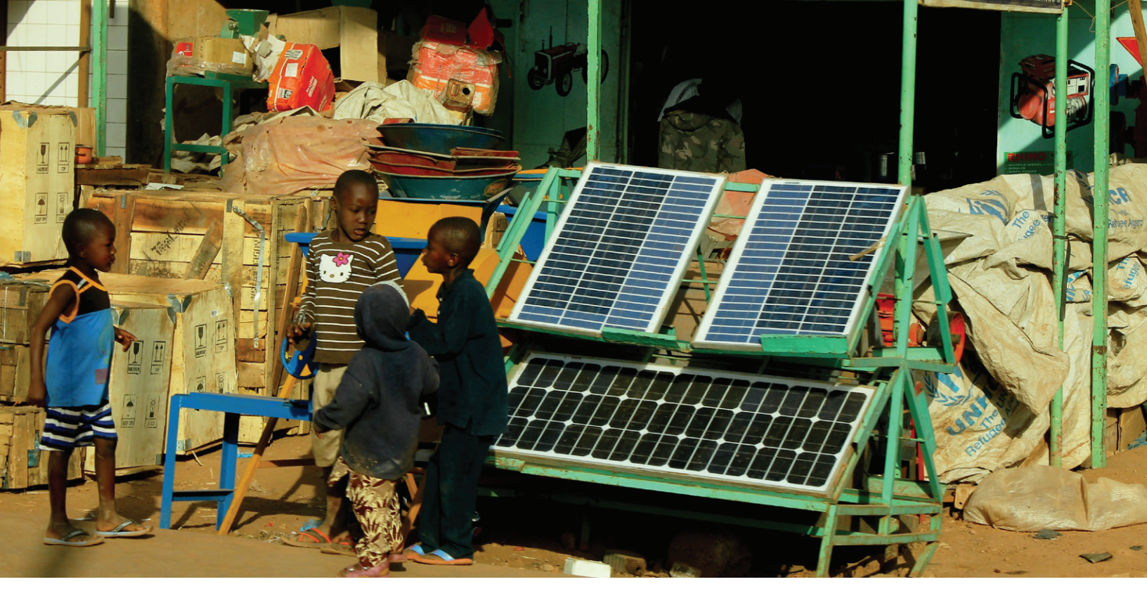
Solar panels in Ouagadougou, Burkina Faso. A picture chosen from AF Photo contest focused on the theme of "urban adaptation and resilience".

Syria Arab Republic: Increasing the climate change resilience of communities in Eastern Ghouta in Rural Damascus to water scarcity challenges through integrated natural resource management and immediate adaptation interventions