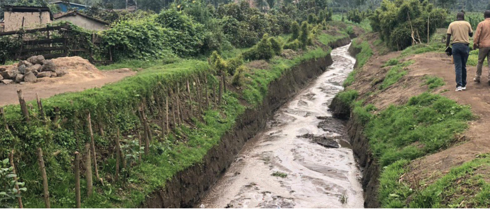
AF project in Rwanda is using agricultural terracing and improved drainage to help vulnerable communities adapt to flooding.

the specific circumstances of each region and promoting coordination, flexibility, and conflict sensitivity can advance climate resilience in conflict-affected and fragile settings.