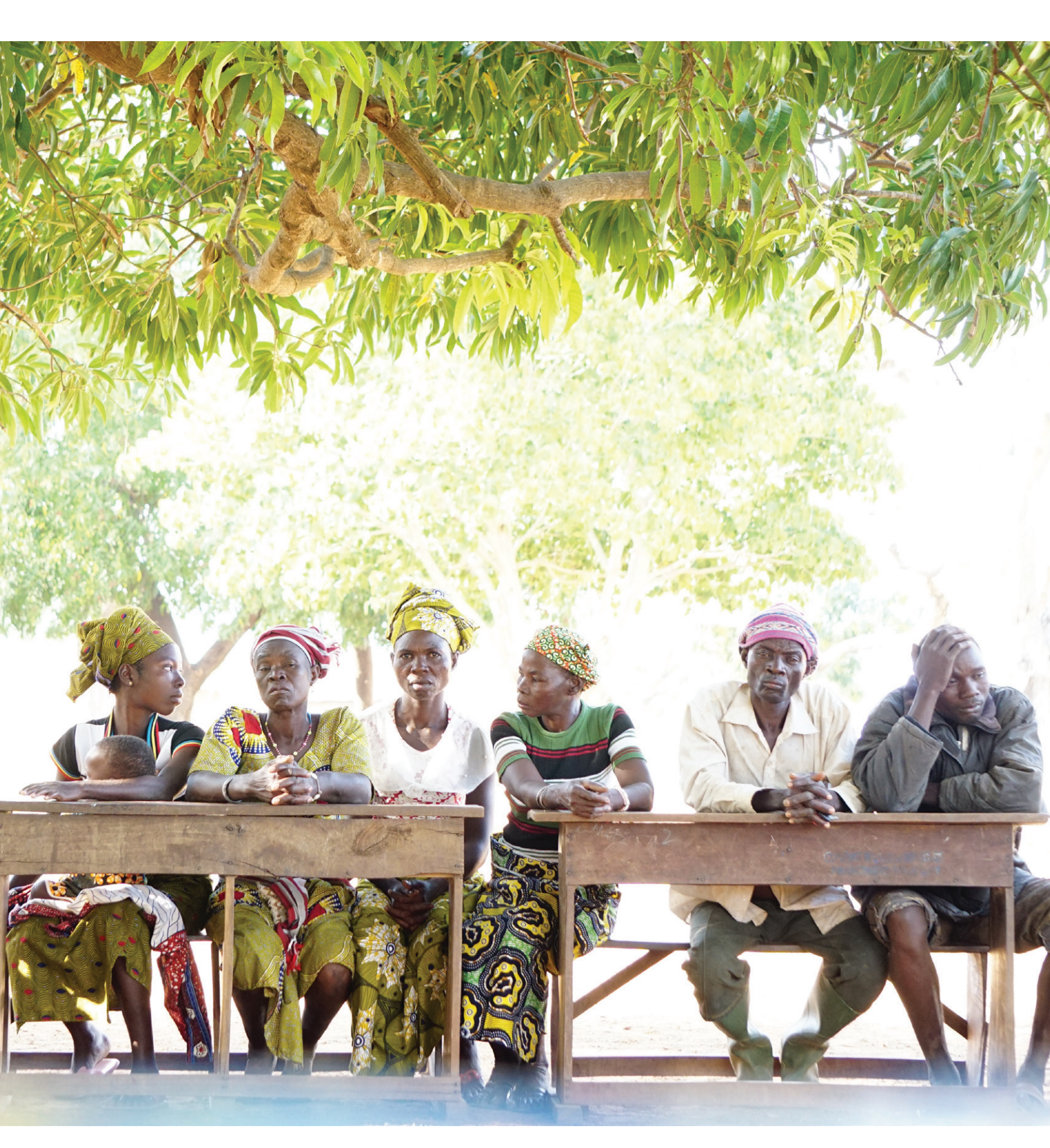
Stakeholder engagement meeting in Ghana.