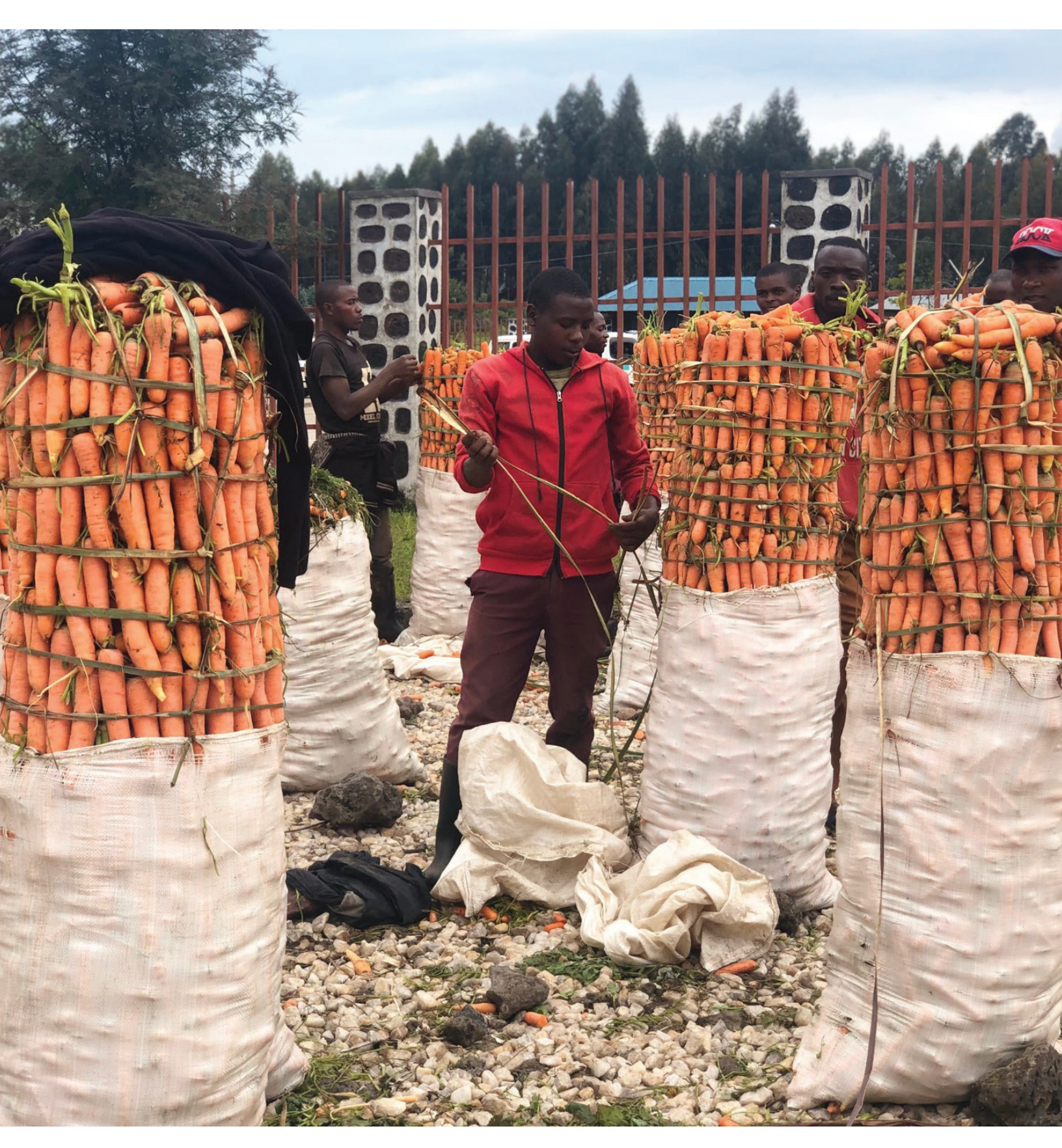
AF-funded community-based adaptation project aimed at adapting to extreme rainfall and flooding, and creating alternative livelihoods and training among young persons in Rwanda.