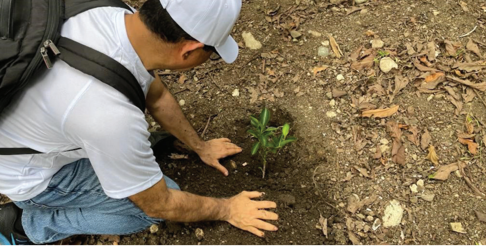
Communities adapting to drought and floods through improving water security and sustainable forest agricultural approaches in Dominican Republic.