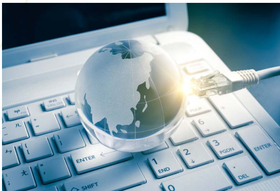
Online GHG Management System